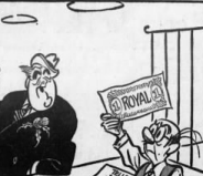
Cardinal Montini, who is expected back in London today...