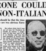
Cardinal Montini, who is expected back in London today...