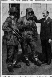
Mr. Profumo when Secretary of State for War inspecting the new carrier uniforms of the Royal Navy.