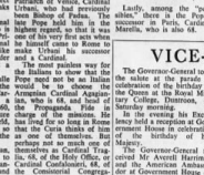
Cardinal Montini, who is expected back in London today...