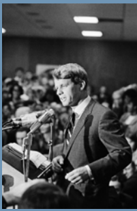
Limited Edition (Numbered and Signed) David Hume Kennerly Photo (Donate $1000)