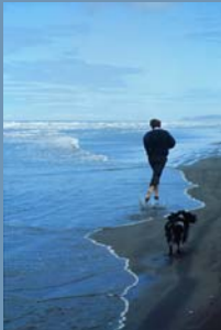
Limited Edition (Numbered and Signed) Bill Eppridge Photo (Donate $1000)

A portion of your donation is tax deductible.