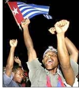
Hoisting the Morning Star flag, the symbol of Papuan rights

If we do not stand in solidarity with the Papuan people, the world risks losing the last remaining untouched rainforest in Asia, home to rich traditional cultures, and over 253 distinct languages. The Papuan people risk losing everything.